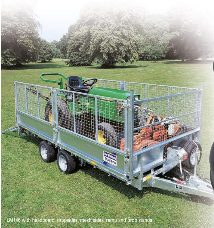
LM146 with headboard, dropsides, mesh sides, ramp and prop stands