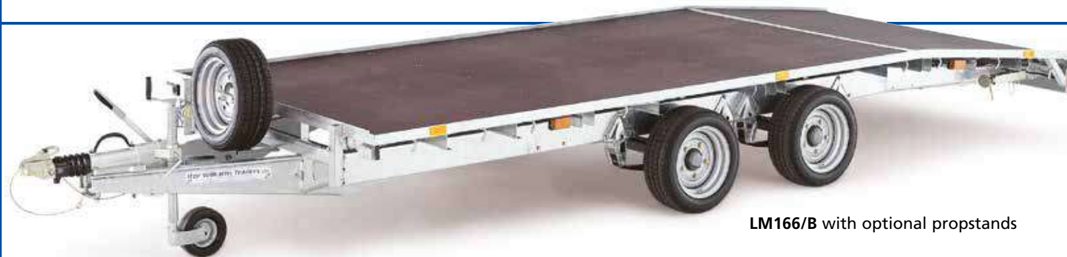
LM166/B with optional propstands

Vehicles with low ground clearance may not be suitable for loading on this type of trailer.