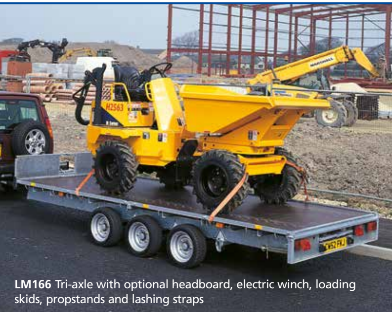
LM166 Tri-axle with optional headboard, electric winch, loading skids, propstands and lashing straps

The maximum gross weight for the LT model is 2000kg, whilst the heavier LM models offer between 2700kg and 3500kg.