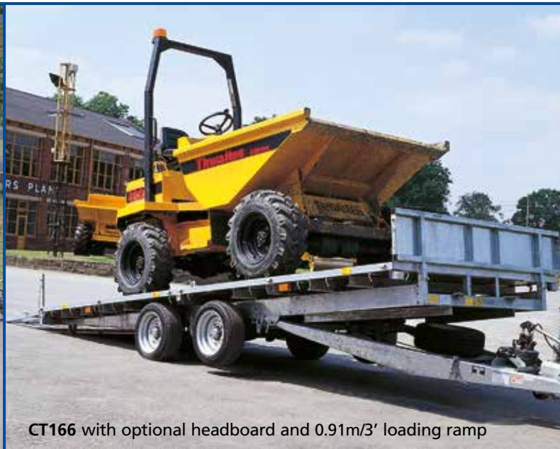
CT166 with optional headboard and 0.91m/3' loading ramp

For owners of vehicles with low ground clearance or those in the vehicle recovery business, the tiltbed is an ideal choice. It provides all the benefits of the flatbed range, combined with an easily-tilted platform for effortless loading.