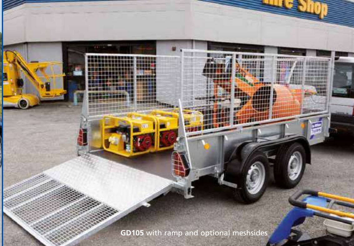
GD105 with ramp and optional meshsides