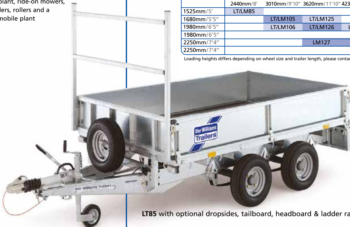
LT85 with optional dropsides, tailboard, headboard & ladder rack

Loading heights differs depending on wheel size and trailer length, please contact your local distributor for more information.