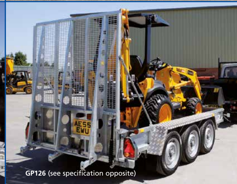
GP126 (see specification opposite)