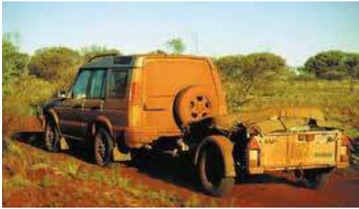
A GD64 at work in the Australian outback

Our General Duty trailers are at home in almost any environment, with virtually any type of load, from building materials to expedition equipment.