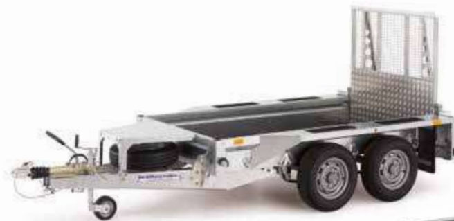
GX84 with ramp