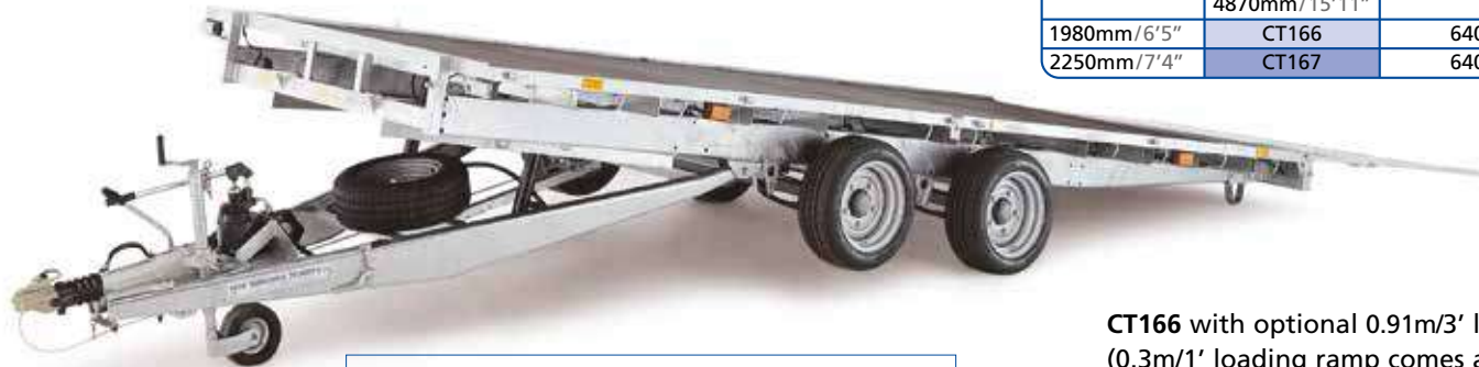
CT166 with optional 0.91m/3' loading ramp (0.3m/1' loading ramp comes as standard)