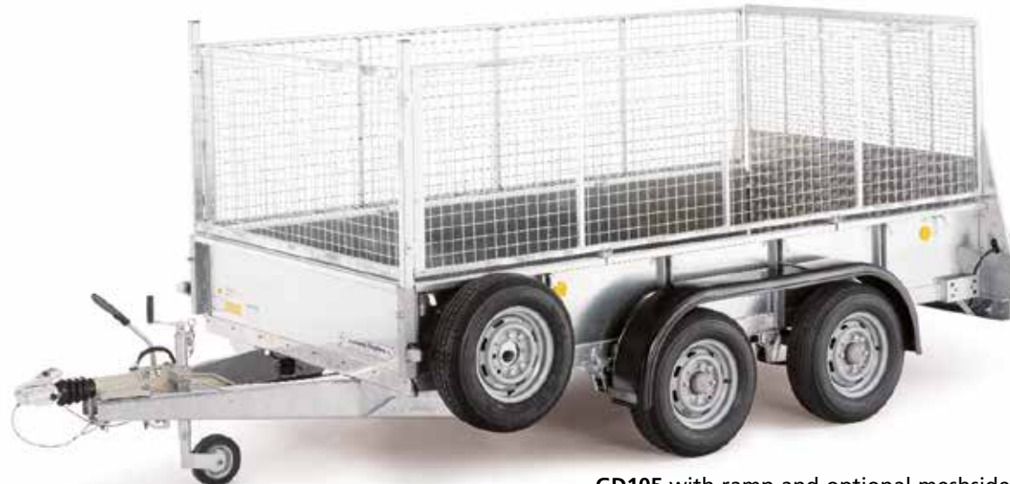
GD105 with ramp and optional meshsides