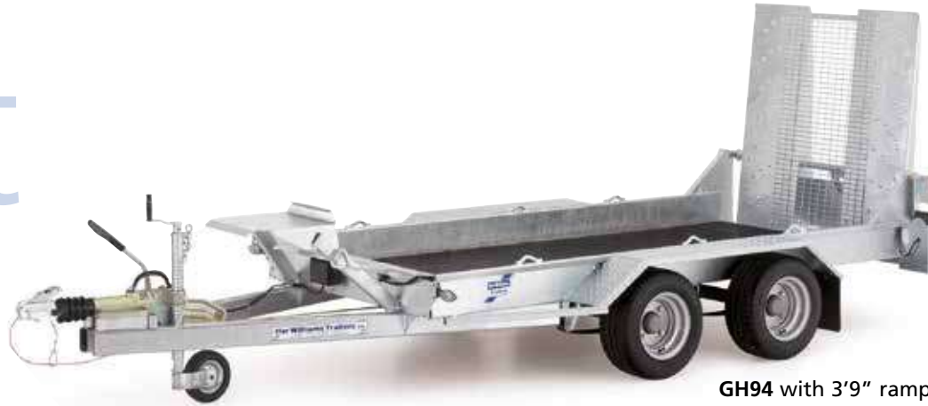
GH94 with 3'9" ramp