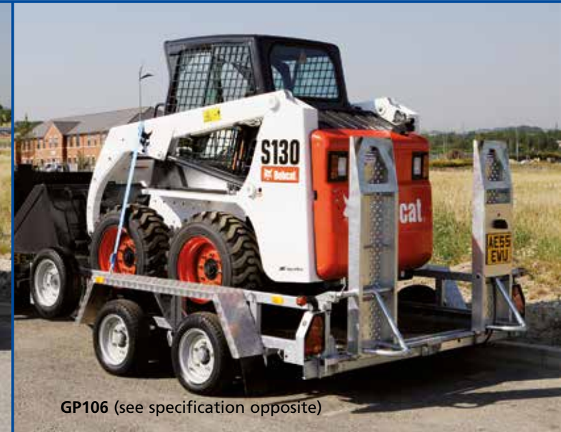
GP106 (see specification opposite)