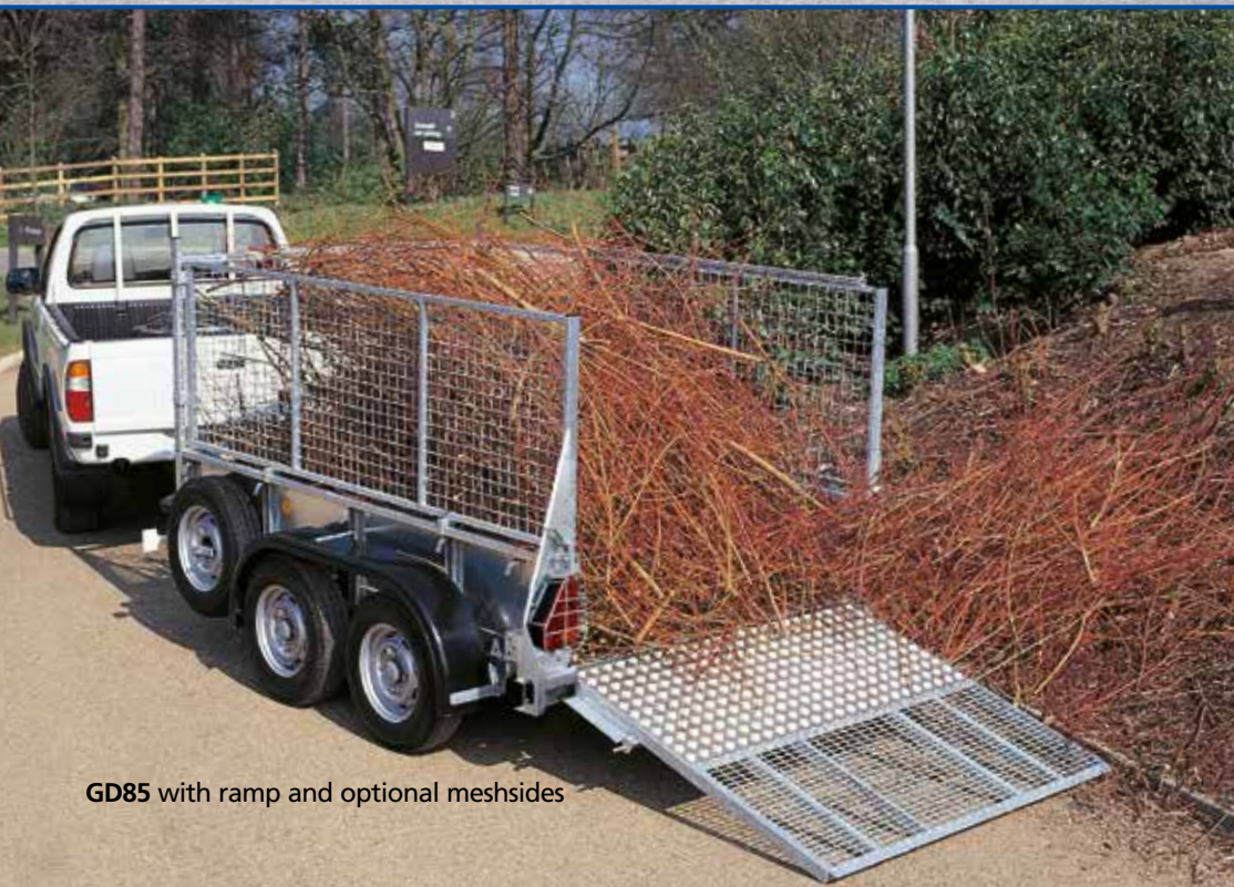
GD85 with ramp and optional meshsides