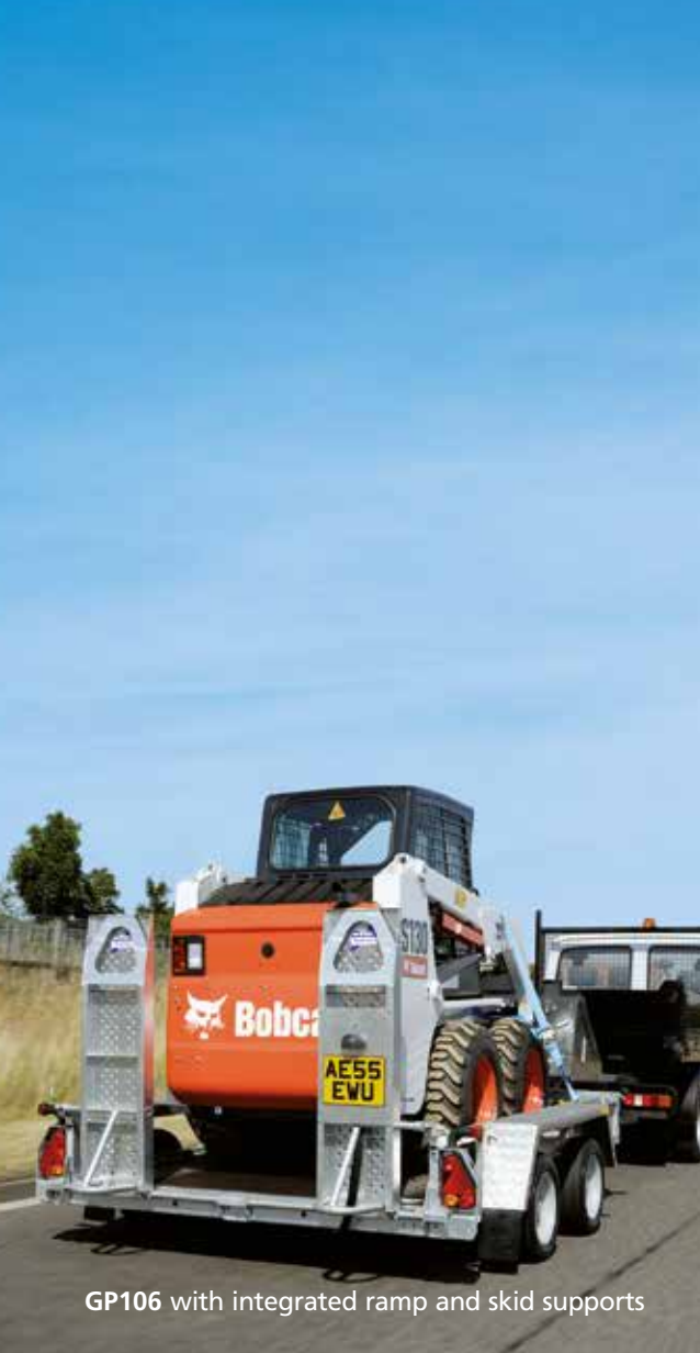
GP106 with integrated ramp and skid supports