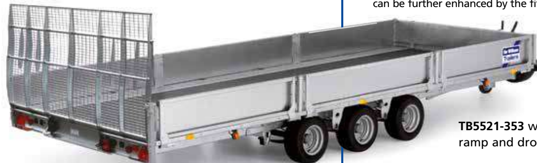
TB5521-353 with mesh rear ramp and drop sides.

In addition to the CT166 & 167 we have a new tiltbed series available offering six trailer models in a range of four lengths, two of which are available in a tri-axle version, and all offer a generous width of 2100mm (7'). Ideal for a range of vehicles including excavators and rollers. Please see our dedicated tiltbed brochure for more details.