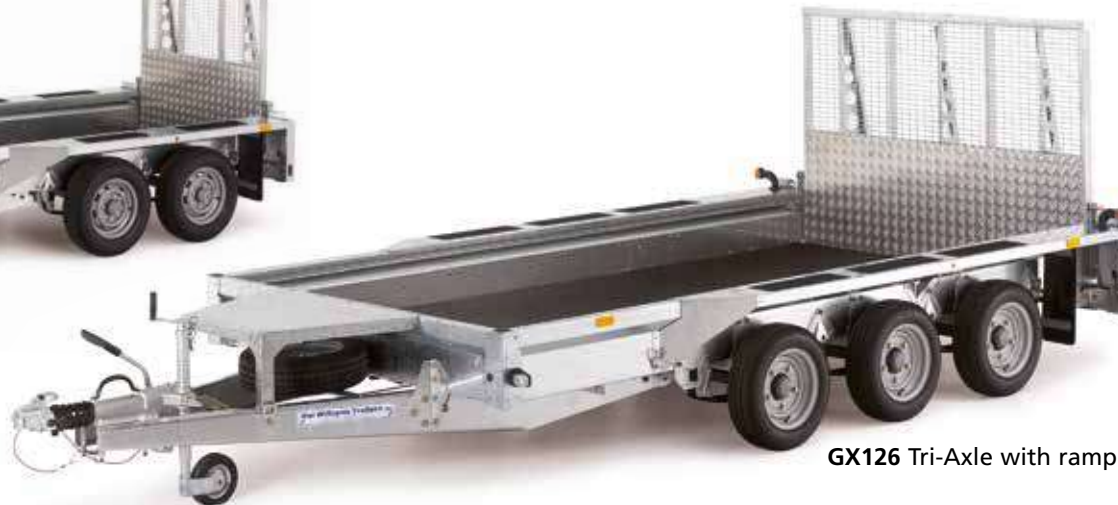
GX126 Tri-Axle with ramp