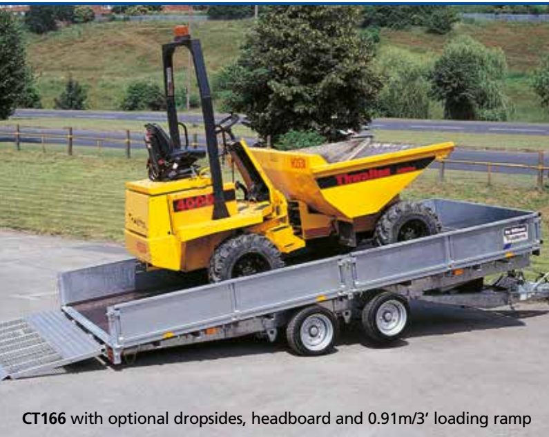
CT166 with optional dropsides, headboard and 0.91m/3' loading ramp