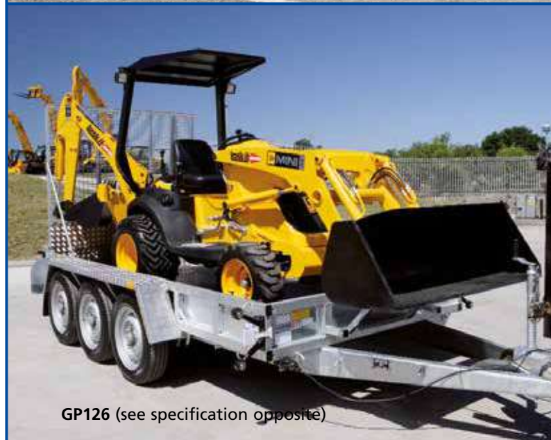
GP126 (see specification opposite)