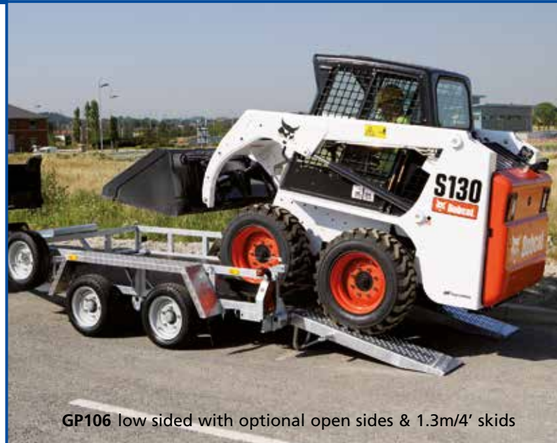
GP106 low sided with optional open sides & 1.3m/4' skids

High sided models come with filled in sides, an optional bucket rest and axles which are more centrally positioned. This option is ideally suited to users who require flexible usage from their trailer; a reliable plant trailer providing higher sides for use as a general duty trailer.