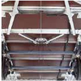
Chassis & floor

It's the attention to detail of Ifor Williams trailers that makes our products so popular with owners. Just take a look at these standard features.