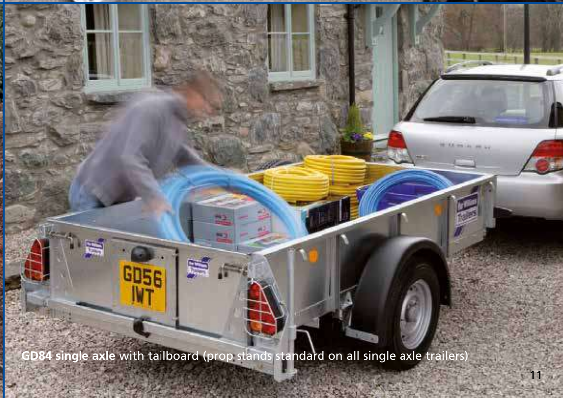
GD84 single axle with tailboard (prop stands standard on all single axle trailers)