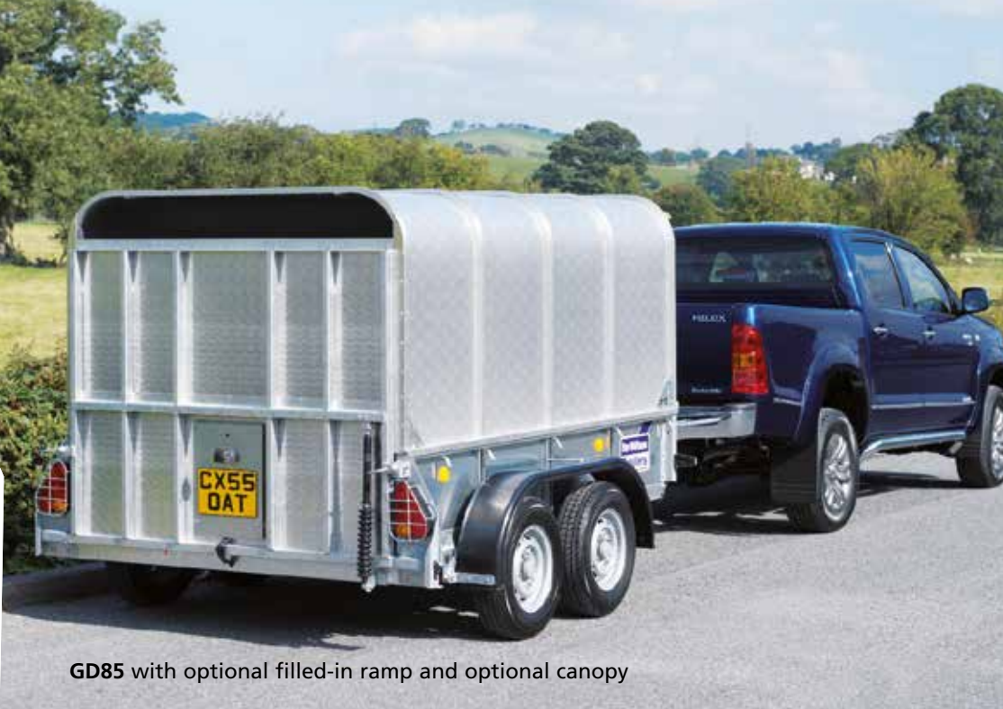
GD85 with optional filled-in ramp and optional canopy