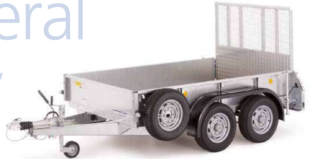
GD85 with ramp