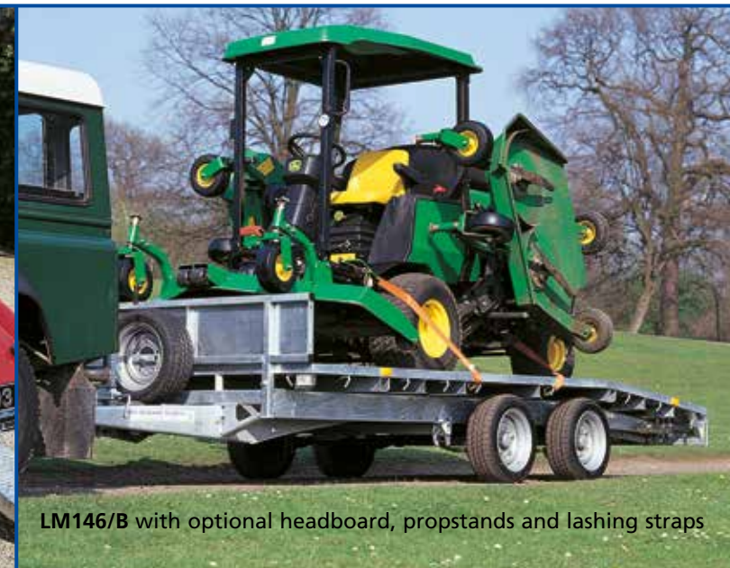
LM146/B with optional headboard, propstands and lashing straps