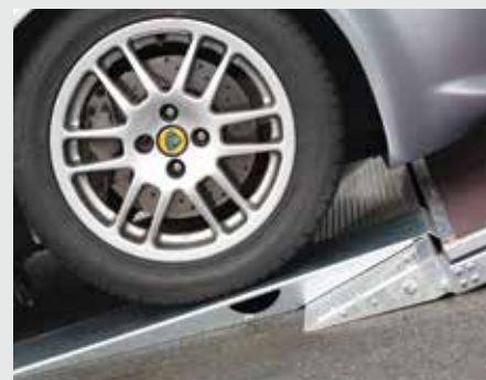
Ramp Skid Extenders Pair of ramp skid extenders to aid loading of vehicles with low clearance.