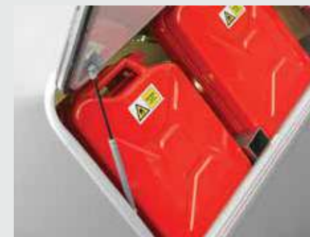
Front Wall Access Hatch The front wall access hatch allows for easy access to the front storage cabinet.