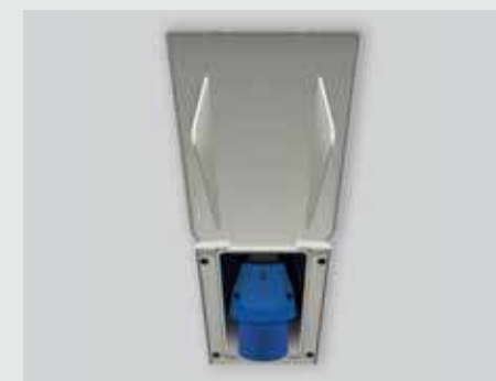
240v on-board battery charging kit Conveniently allows the on-board battery to be charged from a 240v supply outlet.