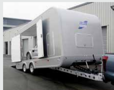
Tilting Drawbar To aid loading vehicles with low ground clearance.