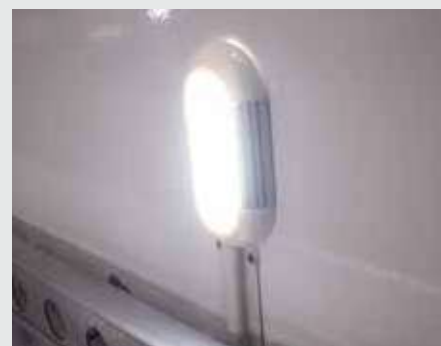
Floor Lighting LED Floor lights for low level illumination.