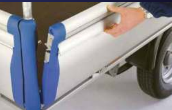
To release the Aluminium dropsides simply apply slight inward pressure to the dropside then lift the latch with fingers to release. The dropsides will only release when pressed inwards prior to the latch being lifted (Lifting the latch alone will not release the dropside).

Eurolight trailers can also be purchased with hinged steel dropsides and / or ladder rack.