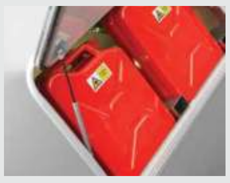
Front Wall Access Hatch The front wall access hatch allows for easy access to the front storage cabinet.