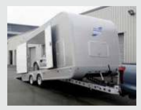
Tilting Drawbar To aid loading vehicles with low ground clearance.