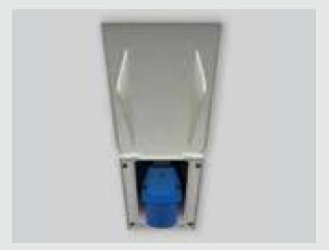
240v on-board battery charging kit Conveniently allows the on-board battery to be charged from a 240v supply outlet.