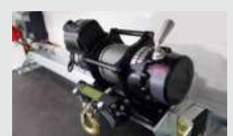
Electric Winch with Battery and Mounting Kit The 12v electric winch has a stated manufacturers' line pull capacity of 4,500 lbs. The sliding winch bracket means the winch can be aligned to the vehicles towing eye.