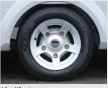
Alloy Wheels Give your trailer the wow factor by adding a set of exclusive alloy wheels.