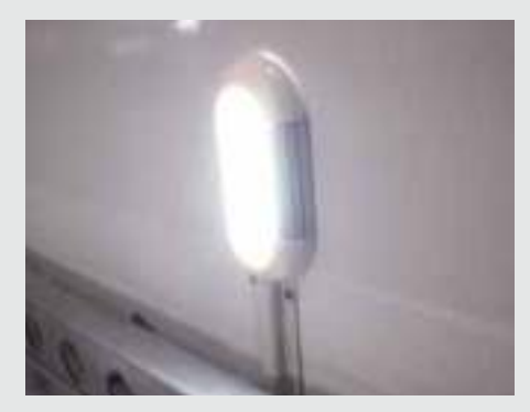
Floor Lighting LED Floor lights for low level illumination.