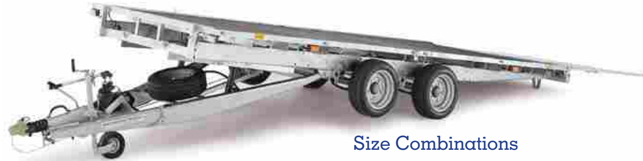
CT166 with optional 0.91m/3' loading ramp (0.3m/1' loading ramp comes as standard)