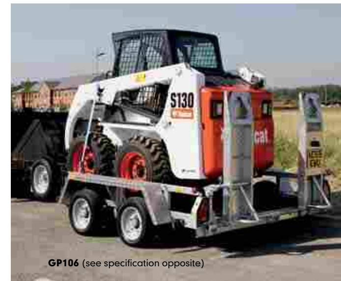
GP106 (see specification opposite)