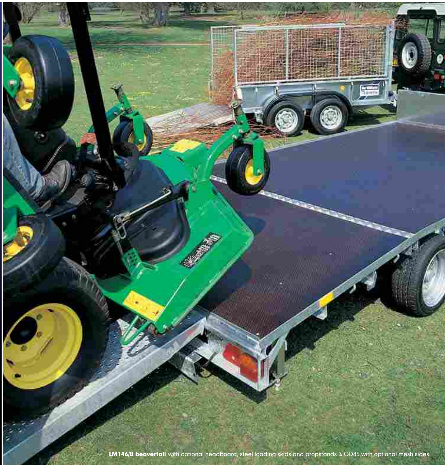
LM146/B beavertail with optional headboard, steel loading skids and propstands & GD85 with optional mesh sides

We are an independent company with one focus: to build the best products on the market. More than 30,000 people choose our trailers each year - but we're not standing still. Our dedicated investment in new technologies and materials ensures that our products continue to exceed the expectations of our customers. We know that quality, strength, value and ease of maintenance are of vital importance to you. That's why we've made them the driving force behind everything we do.