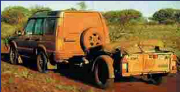
A GD64 at work in the Australian outback

Our General Duty trailers are at home in almost any environment, with virtually any type of load, from building materials to expedition equipment.