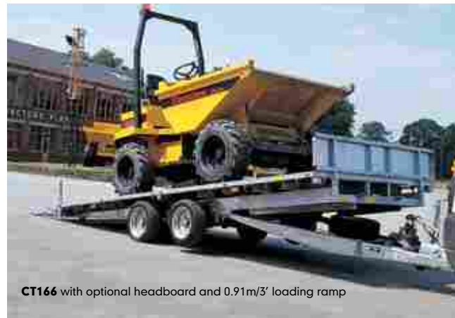
CT166 with optional headboard and 0.91m/3' loading ramp