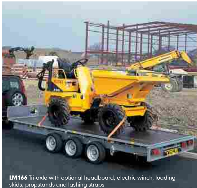
LM166 Tri-axle with optional headboard, electric winch, loading skids, propstands and lashing straps

The maximum gross weight for the LT model is 2000kg, whilst the heavier LM models offer between 2700kg and 3500kg.