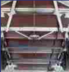
Chassis & Floor

It's the attention to detail of Ifor Williams trailers that makes our products so popular with owners. Just take a look at these standard features.