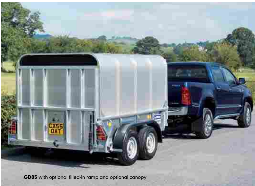
GD85 with optional filled-in ramp and optional canopy