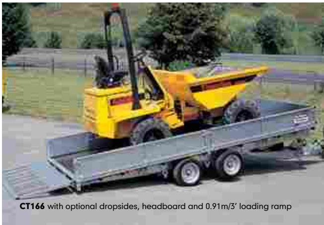
CT166 with optional dropsides, headboard and 0.91m/3' loading ramp