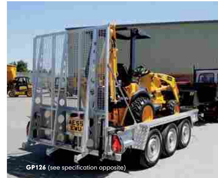
GP126 (see specification opposite)