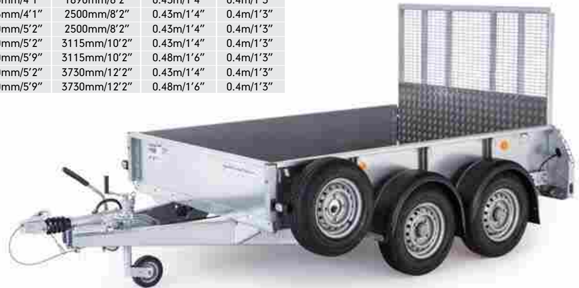
GD105 with ramp and optional meshsides