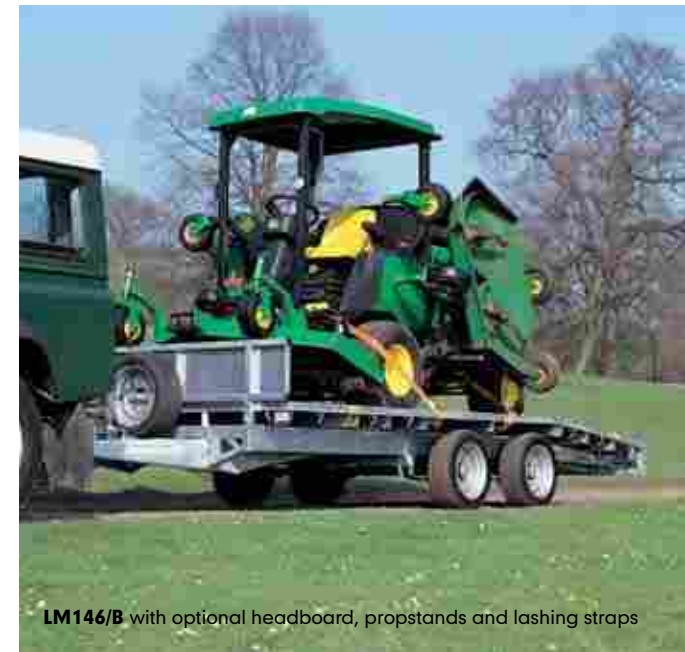
LM146/B with optional headboard, propstands and lashing straps