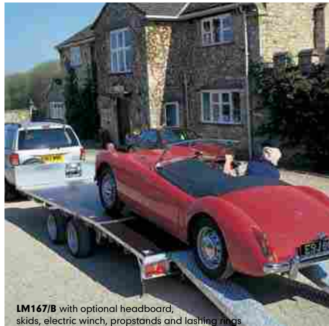
LM167/B with optional headboard, skids, electric winch, propstands and lashing rings