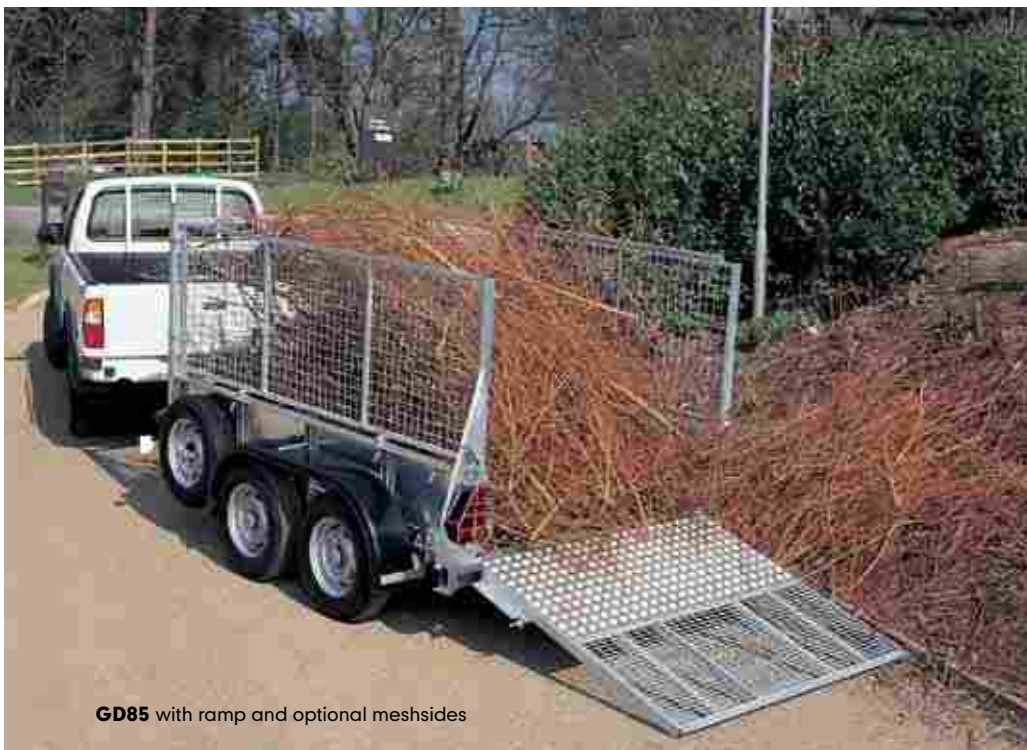
GD85 with ramp and optional meshsides