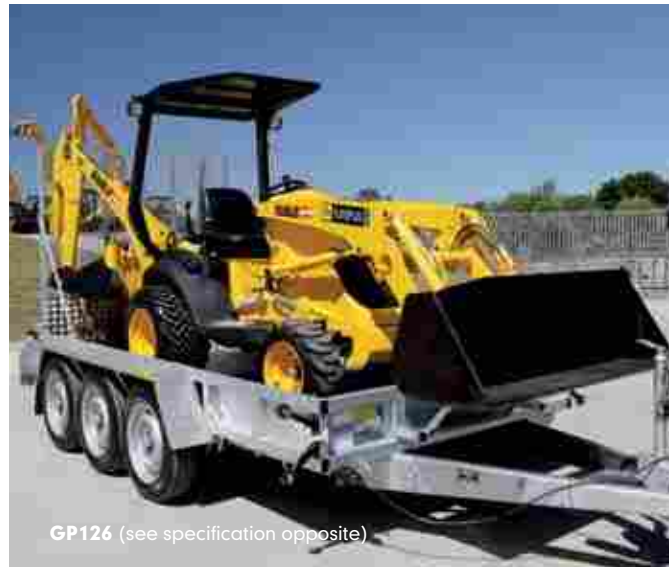
GP126 (see specification opposite)