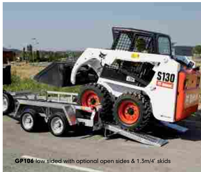
GP106 low sided with optional open sides & 1.3m/4' skids

High sided models come with filled in sides, an optional bucket rest and axles which are more centrally positioned. This option is ideally suited to users who require flexible usage from their trailer; a reliable plant trailer providing higher sides for use as a general duty trailer.