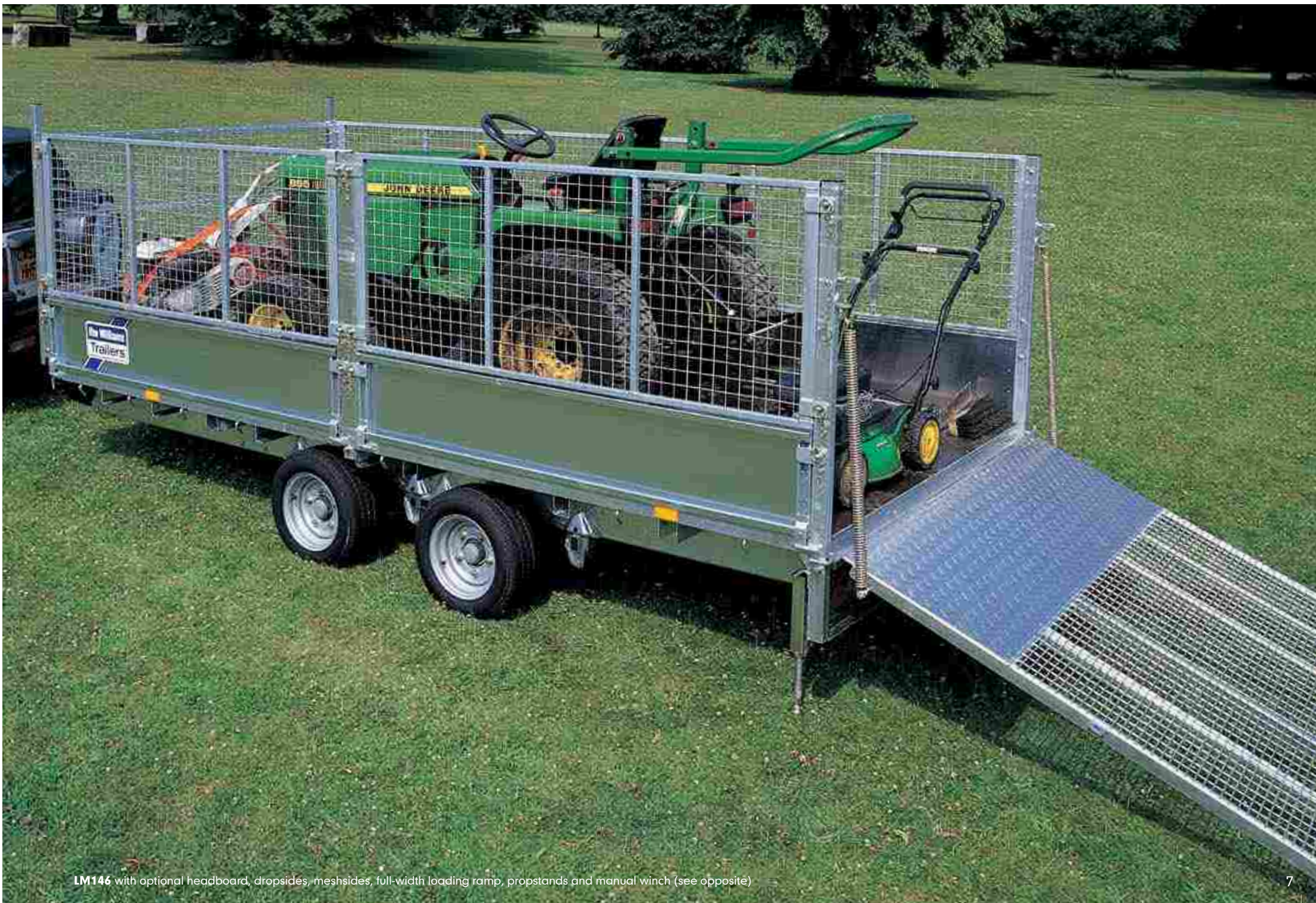
LM146 with optional headboard, dropsides, meshsides, full-width loading ramp, propstands and manual winch (see opposite)