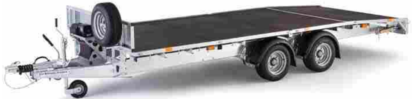
LM166/B with optional propstands

Vehicles with low ground clearance may not be suitable for loading on this type of trailer.