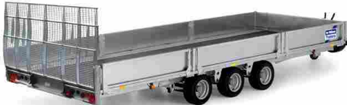
TB5521-353 with mesh rear ramp and drop sides.