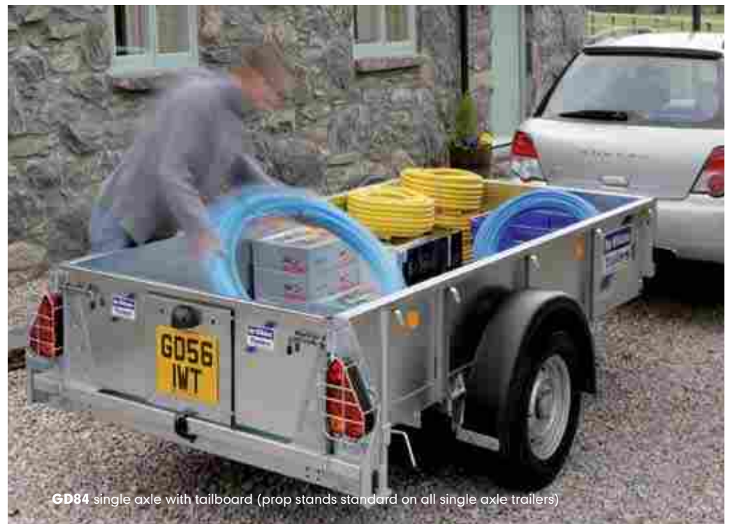
GD84 single axle with tailboard (prop stands standard on all single axle trailers)