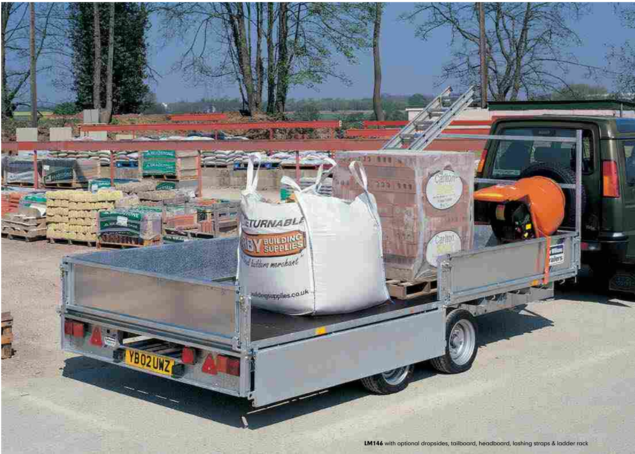
LM146 with optional dropsides, tailboard, headboard, lashing straps & ladder rack