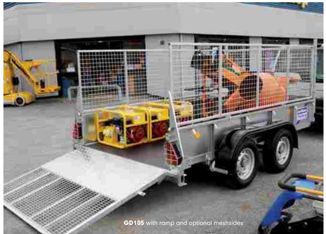
GD105 with ramp and optional meshsides