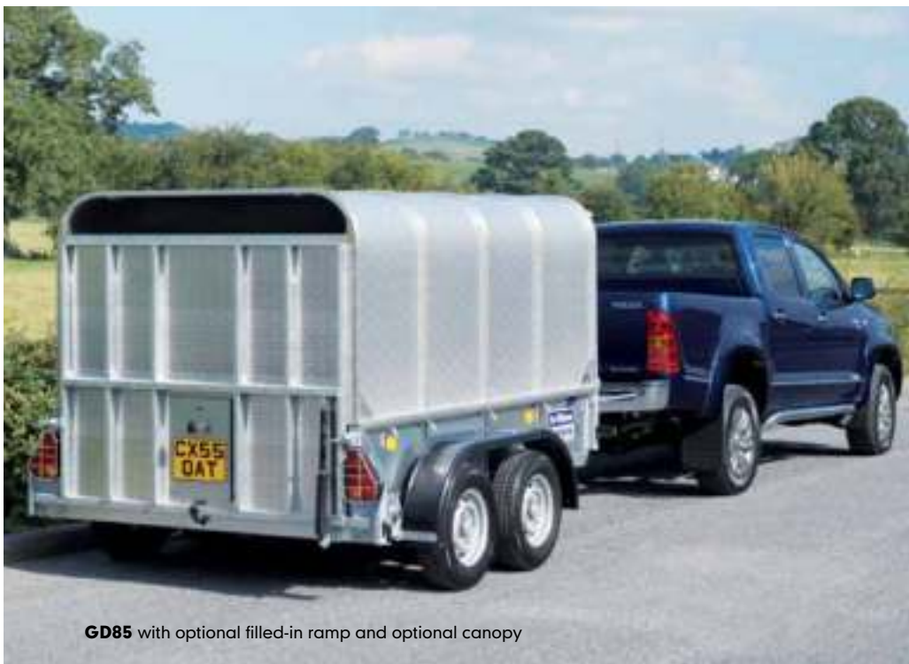
GD85 with optional filled-in ramp and optional canopy