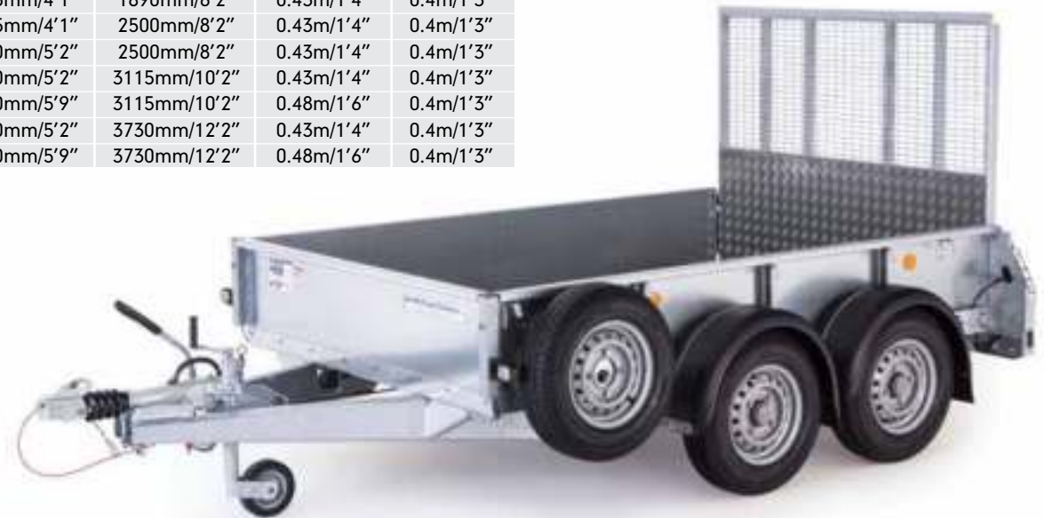
GD105 with ramp and optional meshsides