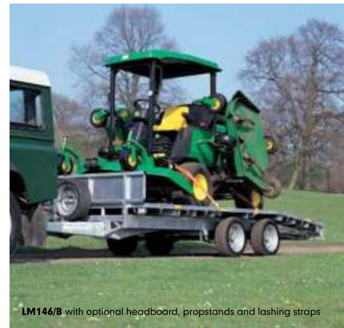
LM146/B with optional headboard, propstands and lashing straps