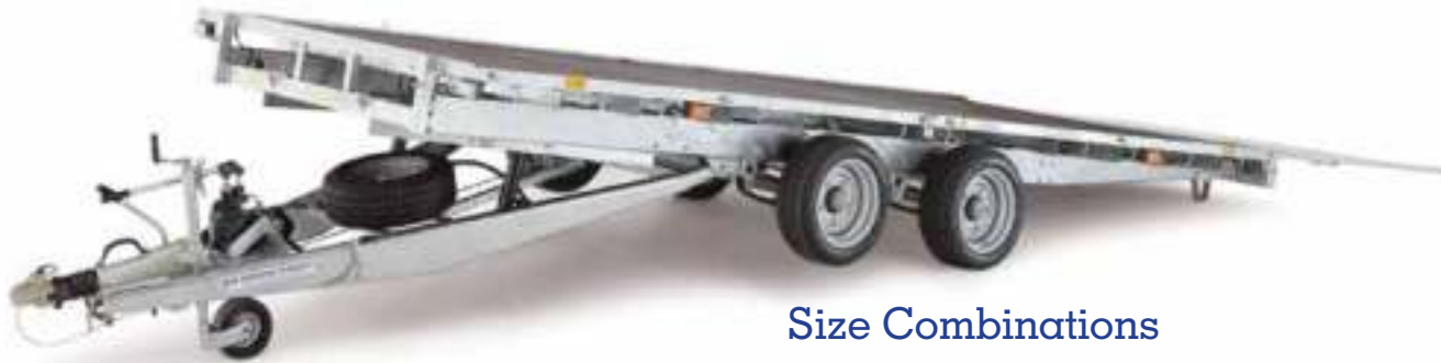
CT166 with optional 0.91m/3' loading ramp (0.3m/1' loading ramp comes as standard)