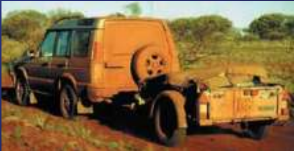
A GD64 at work in the Australian outback

Our General Duty trailers are at home in almost any environment, with virtually any type of load, from building materials to expedition equipment.