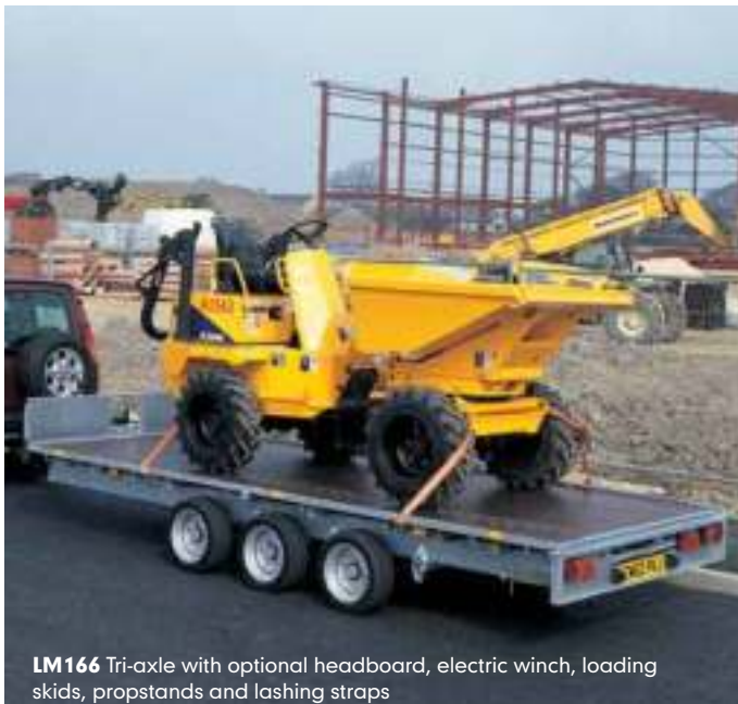
LM166 Tri-axle with optional headboard, electric winch, loading skids, propstands and lashing straps

The maximum gross weight for the LT model is 2000kg, whilst the heavier LM models offer between 2700kg and 3500kg.