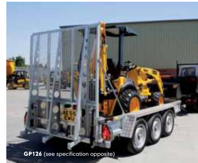
GP126 (see specification opposite)