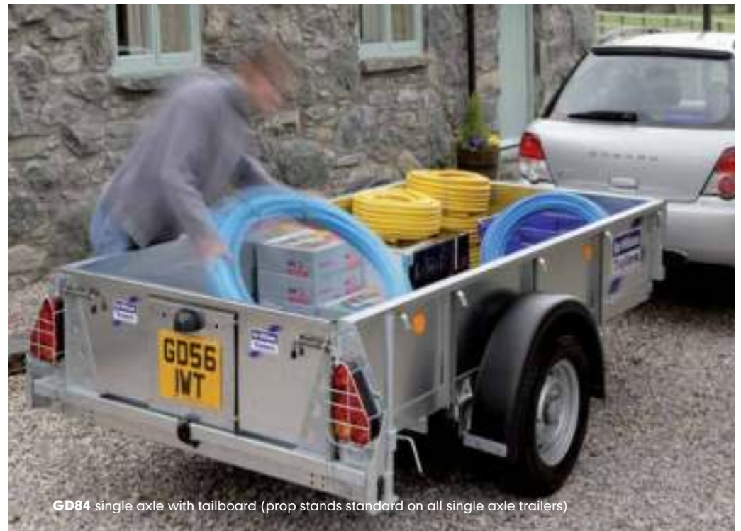
GD84 single axle with tailboard (prop stands standard on all single axle trailers)