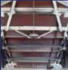
Chassis & Floor

It's the attention to detail of Ifor Williams trailers that makes our products so popular with owners. Just take a look at these standard features.