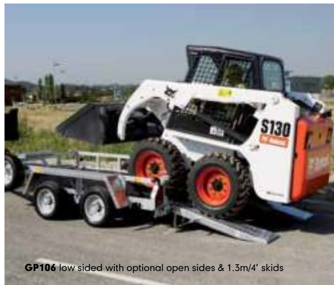
GP106 low sided with optional open sides & 1.3m/4' skids

High sided models come with filled in sides, an optional bucket rest and axles which are more centrally positioned. This option is ideally suited to users who require flexible usage from their trailer; a reliable plant trailer providing higher sides for use as a general duty trailer.