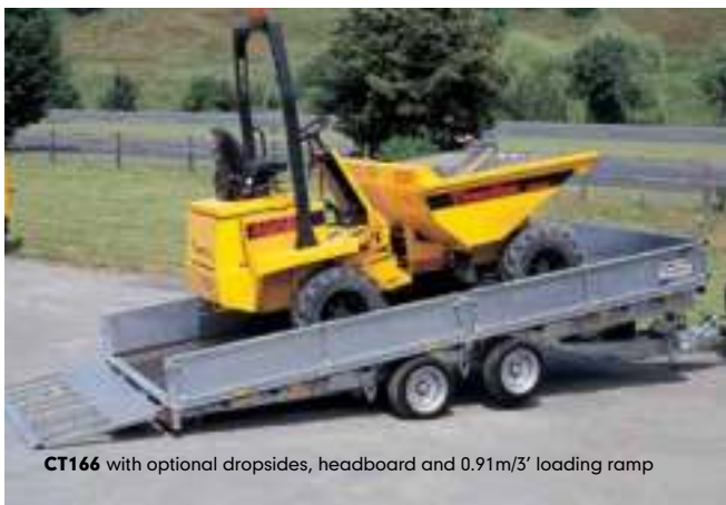
CT166 with optional dropsides, headboard and 0.91m/3' loading ramp