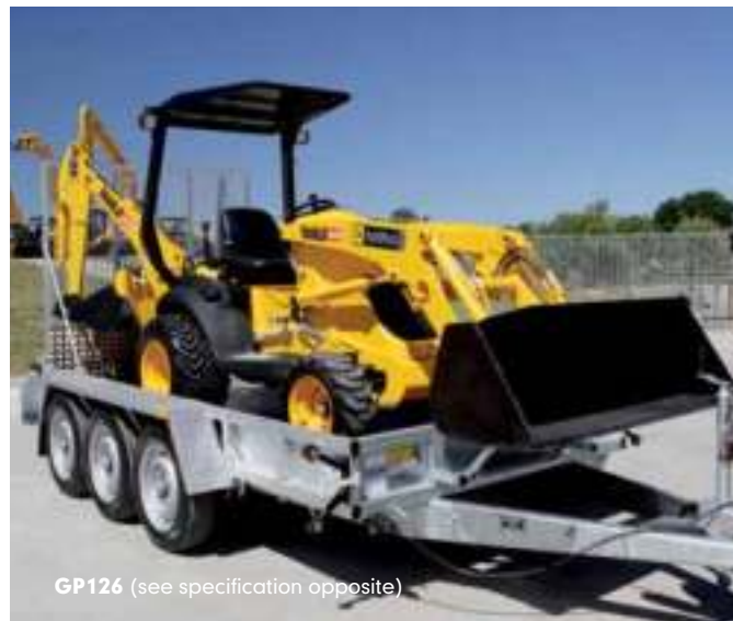
GP126 (see specification opposite)