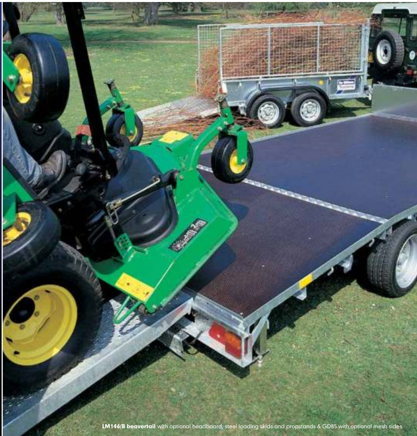
LM146/B beavertail with optional headboard, steel loading skids and propstands & GD85 with optional mesh sides

We are an independent company with one focus: to build the best products on the market. More than 30,000 people choose our trailers each year - but we're not standing still. Our dedicated investment in new technologies and materials ensures that our products continue to exceed the expectations of our customers. We know that quality, strength, value and ease of maintenance are of vital importance to you. That's why we've made them the driving force behind everything we do.