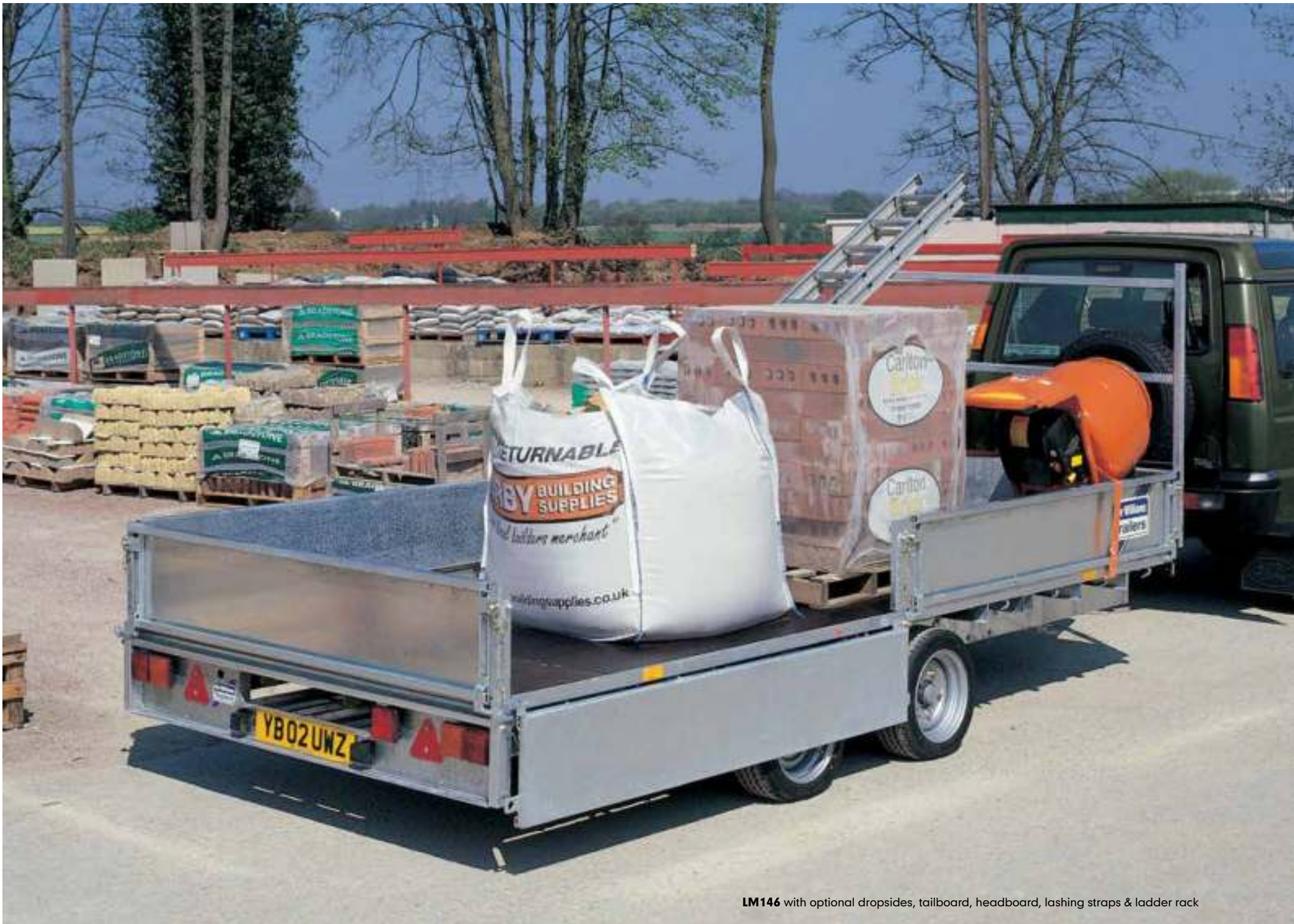
LM146 with optional dropsides, tailboard, headboard, lashing straps & ladder rack