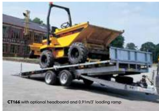
CT166 with optional headboard and 0.91m/3' loading ramp