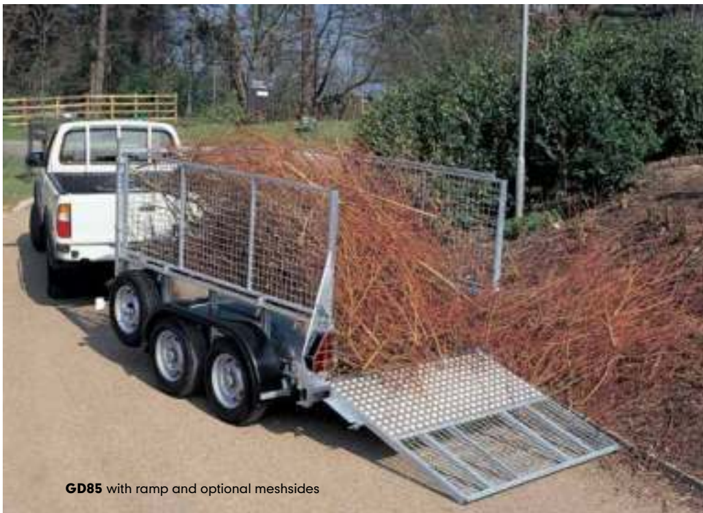
GD85 with ramp and optional meshsides