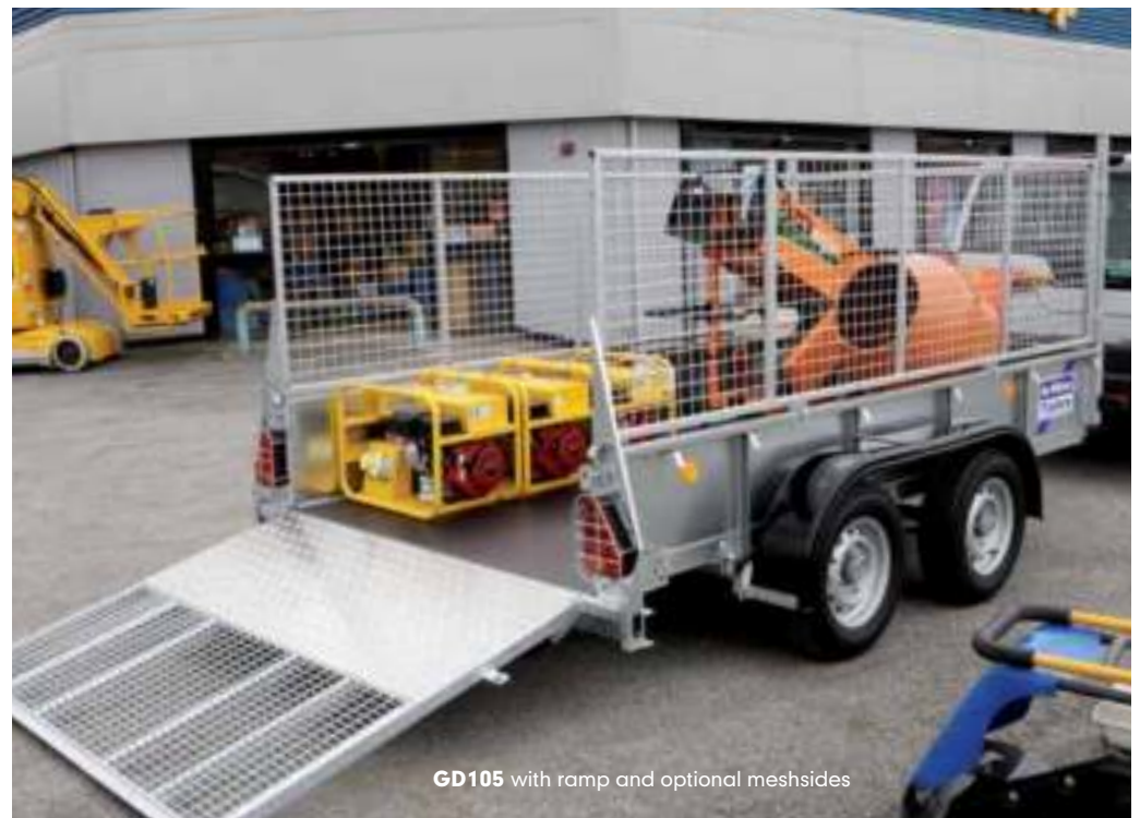
GD105 with ramp and optional meshsides