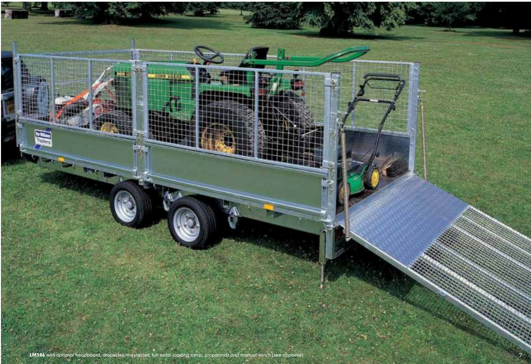
LM146 with optional headboard, dropsides, meshsides, full-width loading ramp, propstands and manual winch (see opposite)