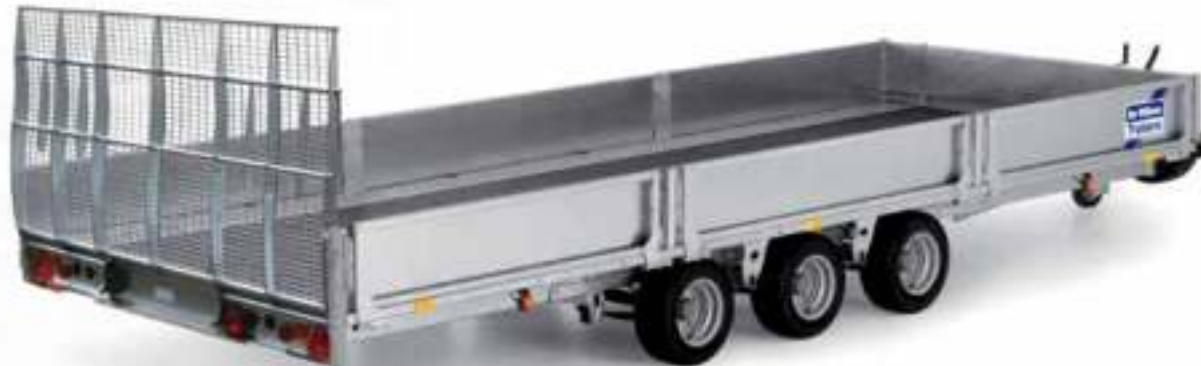
TB5521-353 with mesh rear ramp and drop sides.