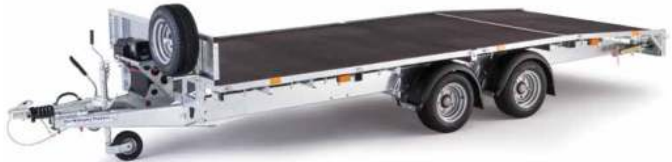
LM166/B with optional propstands

Vehicles with low ground clearance may not be suitable for loading on this type of trailer.