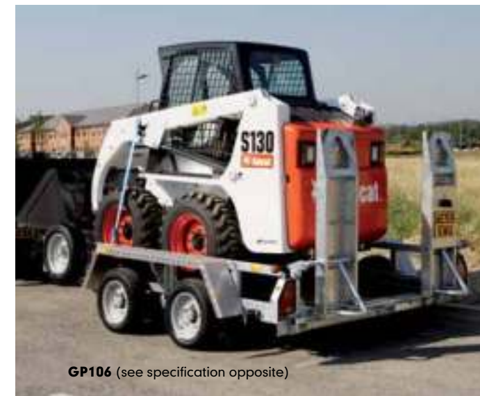
GP106 (see specification opposite)